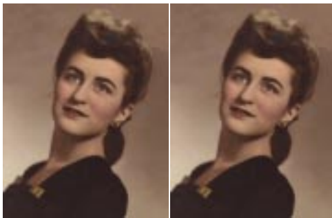
Photo Business Cards